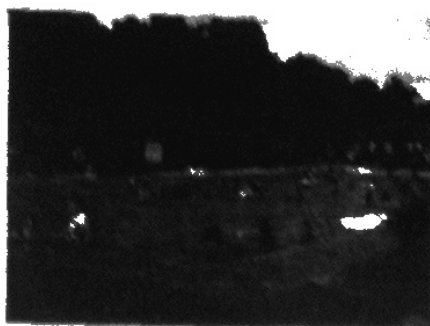
Old Pool - New pool is in process