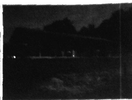
Picnic Area at Pool

--Bass Club Forming, see calender page. --See our news page for event pictures!